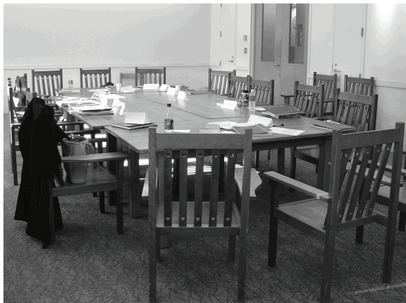
Bard College seminar room, with evidence that writing and thinking have occurred.

and personal life. Participants experienced the precision, liveliness, and imaginative scope of poetic language and learned to incorporate these qualities into their own work. “Reading Human Rights” considered literature that enriches our understanding of human rights and explored ways to incorporate readings that invoke humanitarian issues into our curriculums and classrooms.