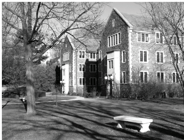
The Bard campus.

I have been doing the Institute strategies since 1983. So my return this year was more a retreat, a chance to dive more deeply into theory and practice, a chance to have someone else run the class. That diving deeper into theory and practice was essential to me, because I had been feeling spiritless in both teaching and writing in the past few weeks.